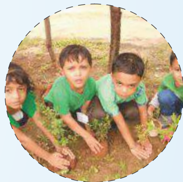
Tree Plantation Day