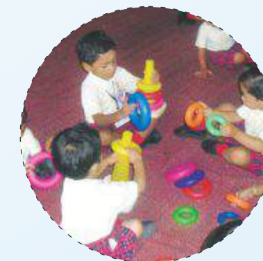
Indoor Free Play