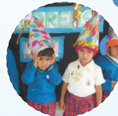
Children's Day Celebration