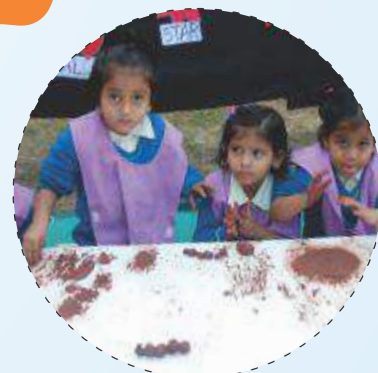
Clay Modeling Activity